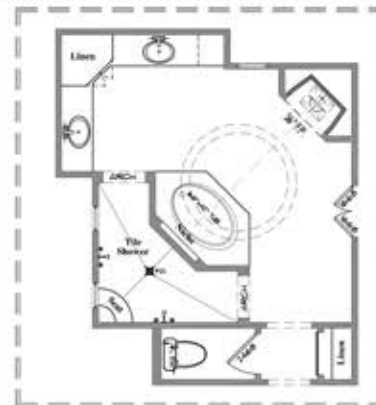
Optional Bath 2 Adds 50 Sq.Ft.