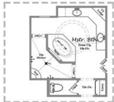
Optional Bath 1